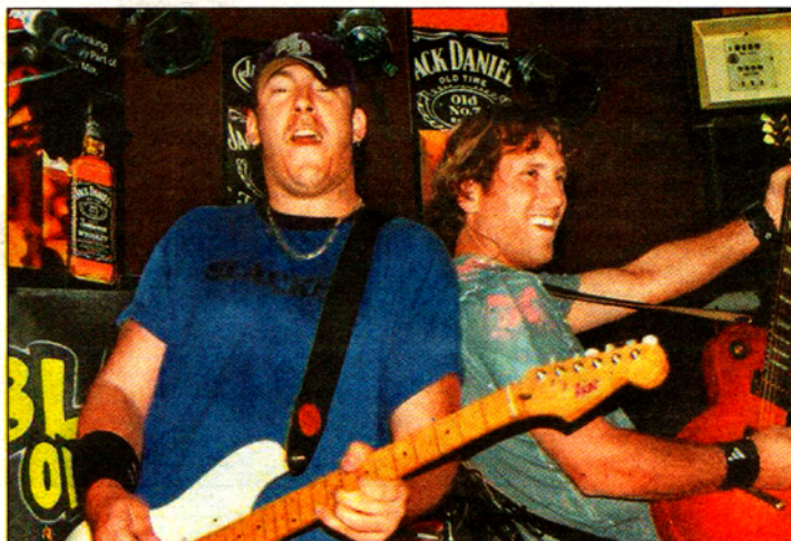
Blame It On Richie puts on a show that is just as much party as it is concert. Join them Saturday night at Southwinds in Forked River.

"Staten Island used to be cover band city, but it's lost that. It used to be a great scene for bands, but now it's all moved to New Jersey," he says. "People are not as serious and that's what we love about New Jersey. You get to the third song, and people are dancing. In Staten Island, it takes them 'til the second set to liven up."